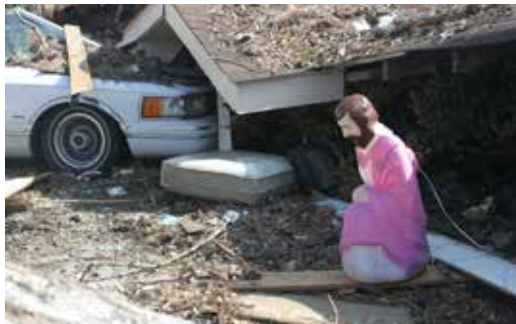
Plastic Jesus sits among the rubble of Hurricane Katrina in Waveland, Mississippi.

Plastic, in both its production and its disposal, disrupts the pastoral image that the psalmist invokes. Still water and green pastures are replaced with toxic chemicals and oil fields. Places like “cancer alley” in Louisiana could easily be considered the valley of the shadow of death. The well-known 23rd Psalm paints a picture of a world where those who trust in God are cared for, protected and guided along life’s journey. The opening suggests a person who has, because of this relationship with God, found contentment. Note that much of the author’s contentment has some connection to the natural world: green pastures, still waters, a head anointed with oil, an overflowing cup, a well-stocked table. Perhaps what is lost in our plastic world is the recognition that the places that restore our soul are the places left untouched by human hands. Perhaps the invitation here is to recognize that creation gives us all that we need if only we are attentive to its gifts.